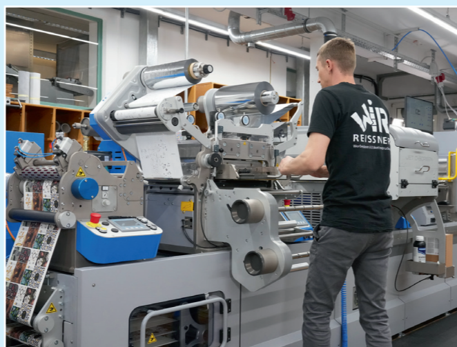
Machine operator on CARTES GT364VHJR